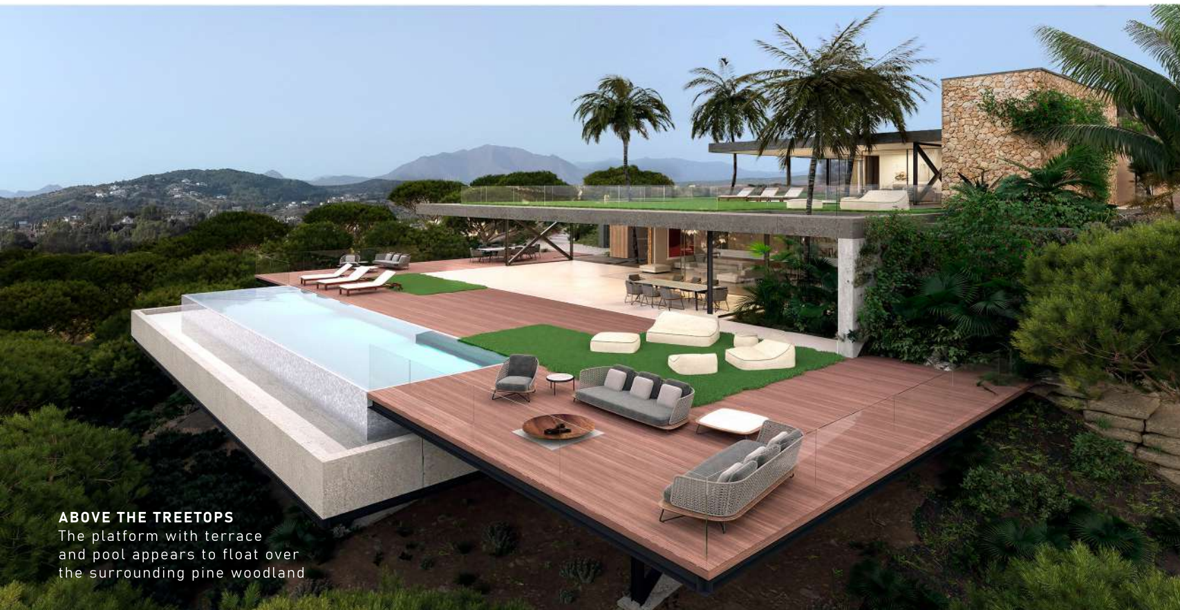
ABOVE THE TREETOPS The platform with terrace and pool appears to float over the surrounding pine woodland

P lots of land on steep slopes are a challenge that architects and developers are often reluctant to take on. Complex construction and planning as well as high costs all present problems and it all depends on the conditions of the plot in question. One possibility is to terrace the area. But this raises questions of feasibility on such a site. How many retaining walls and stairs are there? What is left of the view afterwards? How good would street access be? A second approach would be to anchor a number of massive concrete pillars deep into the ground and build a platform on top, strong enough to securely support a house and pool. Especially in the coveted mountainous coastal regions of Spain, for example on the Costa del Sol, the Costa Brava or in the southwest of Mallorca, there are still numerous plots previously considered too difficult to build on due to their hillside locations in terms of location and potential